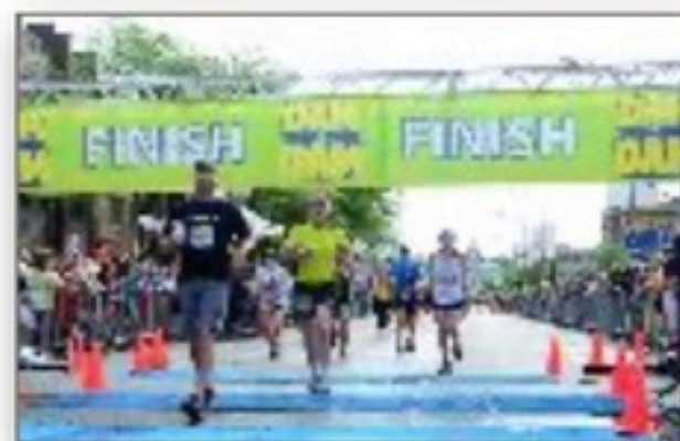
#6 Iowa's distance Classic Dam to Dam ended in 2018 but its memory lives on. The race donates $10,000 each year to 15 area running groups, a fitting tribute to a great race that hasn't reached the finish line.