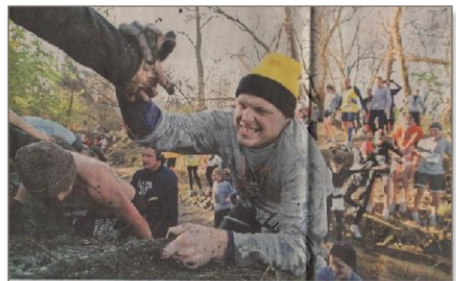
#7 What's up or rather down almost 6,000 entrants. Once known as the largest US cross country race, the glory days of Living History Farms are just a memory. Regardless the "farm race" continues as a great race at the end of the season.