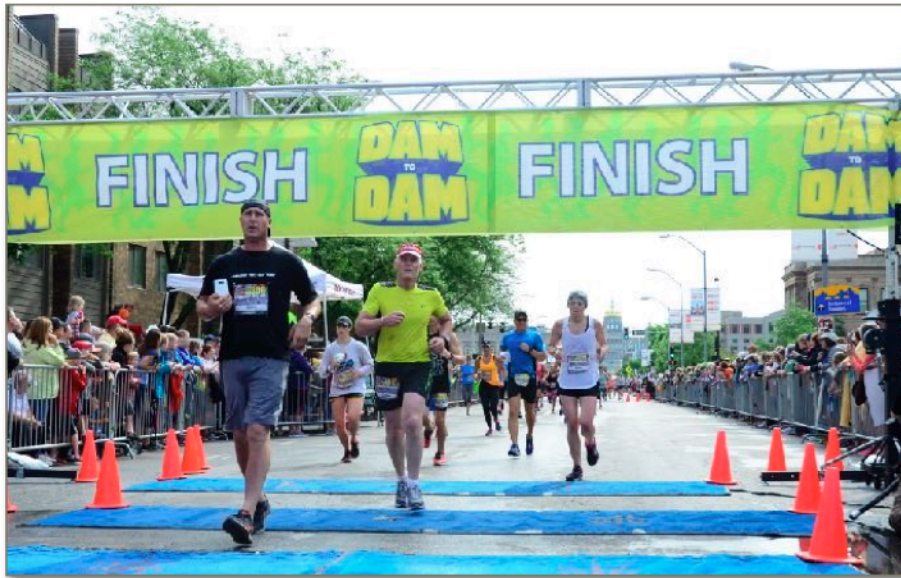
#1 Dam to Dam, Iowa's Distance Classic ended its 39 year run. 120,000 finishers trekked from Saylorville Dam to downtown Des Moines over the years at this quintessential race.