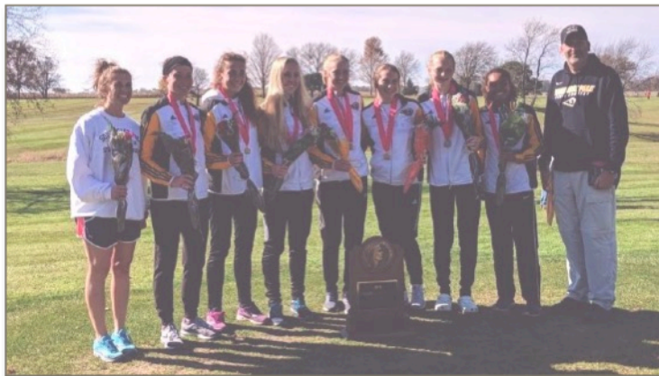
#3 Unranked at the beginning of the season Southeast Polk girls won the State High School Cross Country Championship beating previously unbeaten & 3-time state champ Johnston by 1 point.