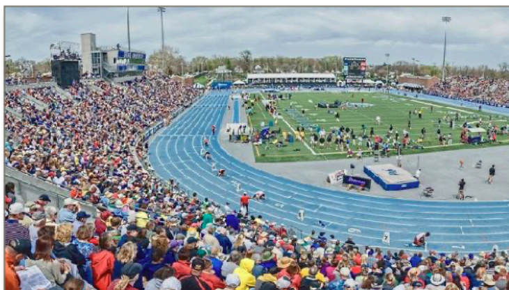
#5 On-the-Road the Drake Relays celebrated 50 years . . . as a Marathon for half its life (1969-1993). The thrill of being part of the relays and finishing on the blue oval captivates thousands at this rite of spring.