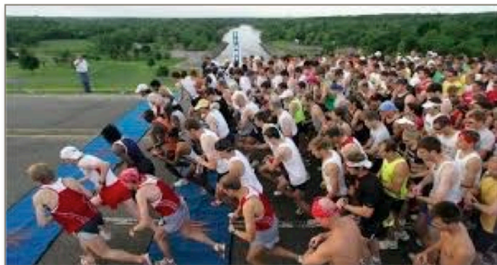
#3 Dam - the start of another great race. Dam to Dam ends at 39 but the new DAM to DSM starts with young organizers, ideas and energy. Over 5000 entered the beginning of the new dam race.