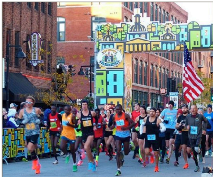
#1 IMT Des Moines Marathon is now the largest race in Striderland and the most impressive. It's a weekend of racing with Marathon, Half-Marathon, 5 mile, 5k distances. . . and the list goes on. Turning 18, it's matured and ready for years of great racing.