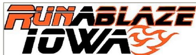
#4 The men and women of orange are blazing near the front of every Striderland race. Iowa's racing team not only is on the podium at area races but competes with the best throughout the nation, with 6 making the Olympic Trials. Over 50 runners are on the team, keeping the competitive dream alive.