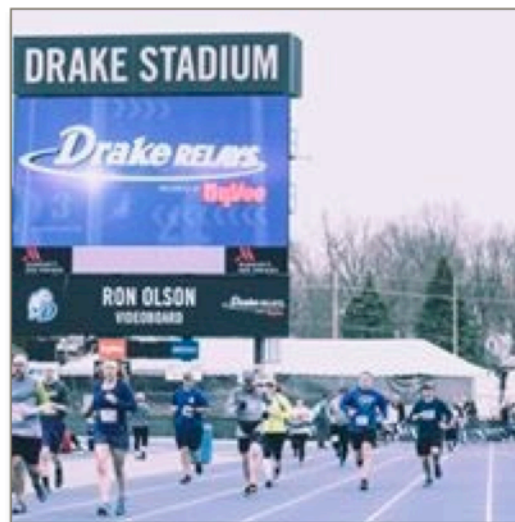
#5 On-the-Road at the Drake Relays has doubled the number of finishers in just 2 years. Perfect weather, finishing on the blue oval and adding a 10k kicks off the relay week - a great combination. Spring has arrived at this 51 year old race.